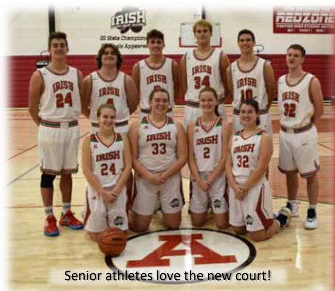
Senior athletes love the new court!