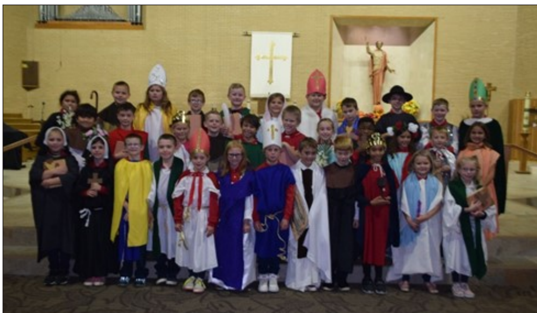
Pictured is the Class of 2032 at the All Saints Ceremony on November 1, 2022. Every year at Sacred Heart Academy, each third grader researches a saint, dresses as that saint did, and delivers a short speech about the life of their chosen saint in a special program following the Holy Day Mass.

We have many long-standing traditions at Sacred Heart Academy, one of which is the All-Saints ceremony, where third grade students dress up as their favorite saint, then recite a brief history on that saint to the congregation. As always, our students executed their parts impressively this year, and were excited to share their facts about the saints. This is just one of the many special “extras” SHA students get to experience.