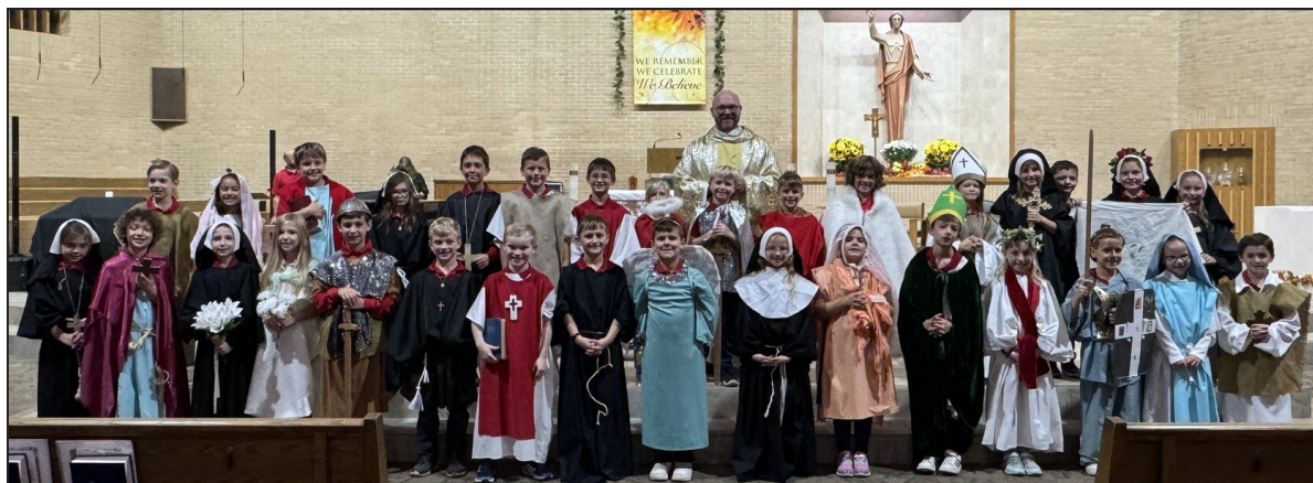
LEFT: The Class of 2034 (current third graders) share facts and dress as a chosen saint at the All-Saints Mass on November 1, 2024.