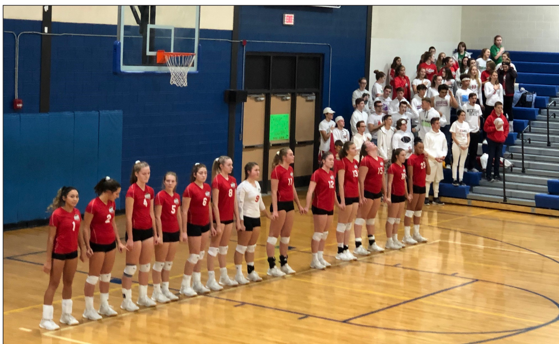
Teammates and their family members create a special bond at SHA. Relationships are formed which last forever, both on and off the playing surface. Pictured here: the SHA 2019 Varsity Volleyball Team. In the background, the Irish cheering section.

As we enter into the blessed Christmas season, I want you to know how grateful I am for you, and for your dedication and commitment to our school. Thank you for sharing your gifts with us, especially the gift of your children. May God always bless you.