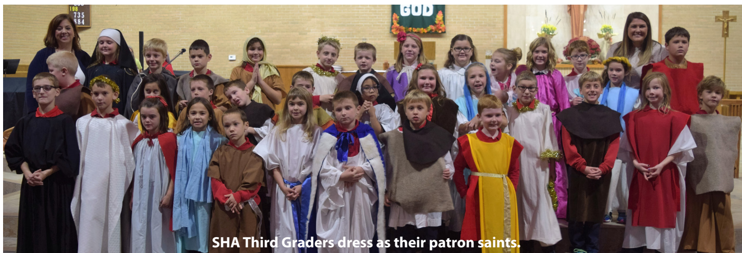
SHA Third Graders dress as their patron saints.

Thank you for your continued support. We appreciate each of you more than you know. And now, here is my shameless plug if you are wondering how you can help. On the 40th anniversary of the Sacred Heart Academy Foundation, please consider making an end-of-the-year donation. This is a gift that lives on in perpetuity, as only the interest is spent each year. Your generosity is another of the many reasons I am proud to be part of the SHA family. Have a blessed Christmas season.