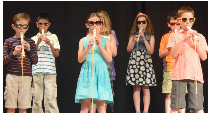
Third graders play their recorders with style at the Spring musical in May.