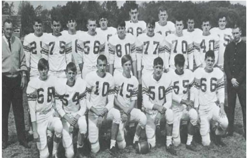
Sacred Heart's 1965 Football Team:

Plans includes a re-dedication ceremony on Thursday August 27th and acknowledgments Friday at each halftime. MPHS is organizing a reunion of it's 1965 football team and we'd like to have as many of our 1965 team introduced at our game also. If we get a large enough number we'll introduce as a group on the field, otherwise we'll read names and have players stand. Please check in at the entry gate if you come so we'll know who is there. Halftime would be around 5:45-6:00 pm.