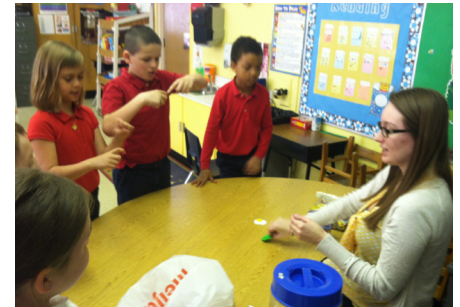
Second graders participate in sign language instruction.

These programs are just two examples which illustrate SHA's commitment to academic excellence and unequivocal parental support and dedication. I look forward to sharing a detailed update on our enrollment and exciting changes coming to the Academy during this upcoming school year.