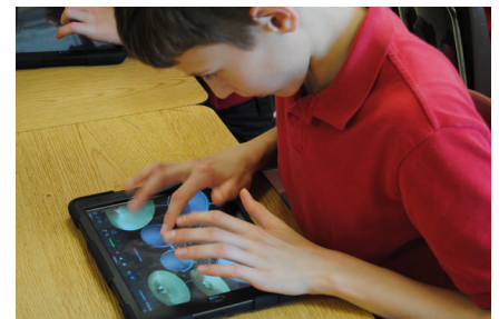
Drum banging sounds great on iPad's "Garageband" application.