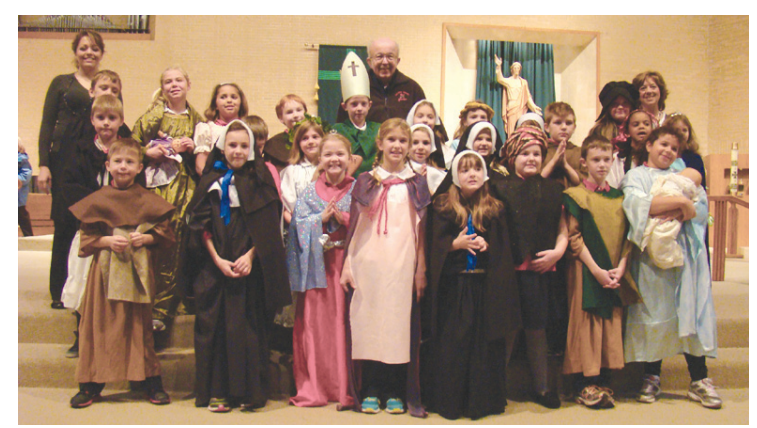
It's a tradition at SHA when the 3rd graders dress up as saints at the conclusion of the All Saints Day Mass celebration. Each student shares a brief history of their saint, whose name many times coincides with the student's name.