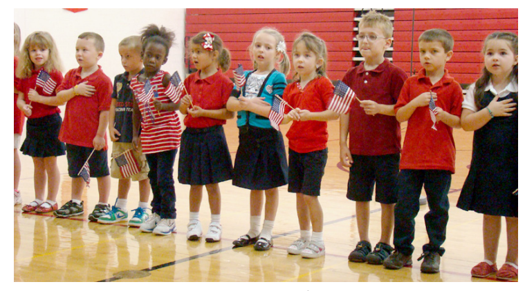
SHA kindergarteners recite the Pledge of Allegiance during the Constitution Day Assembly.